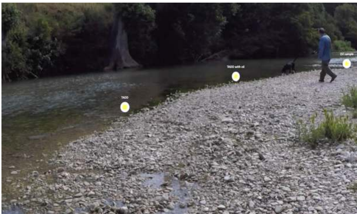
Figure 2: Baseline setup

The training aids were left to naturalize for 1-hour before being worked.