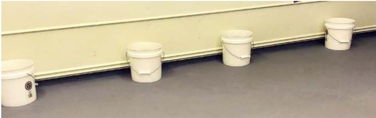
Figure 4: Bucket line-up

This session aimed to confirm no contamination or false positives within the bucket line-up.