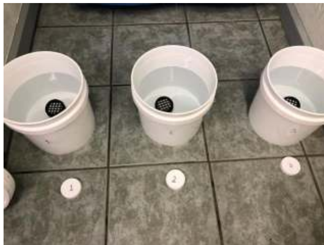
Figure 7: Bucket line-up

This trial aimed to confirm that a TADD containing oil underwater would produce a sheen or not.