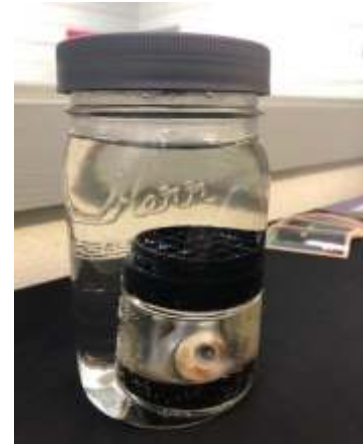
Figure 1: Mason jar containing TADD in water with oil and washer

2.3.3.4 Water – Standard drinking water was utilized, and all purchased from the same source.