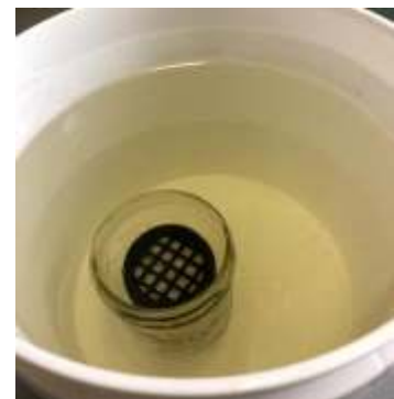
Figure 5: TADD in a bucket

The buckets were prepared 24hours before the trial. The TADD was 6" below the water's surface.