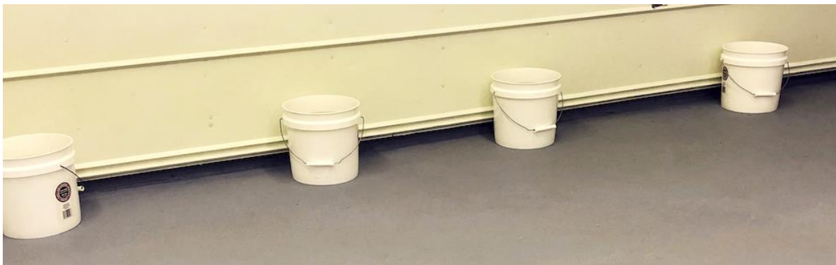
Figure 4: Bucket line-up

This session aimed to confirm no contamination or false positives within the bucket line-up.