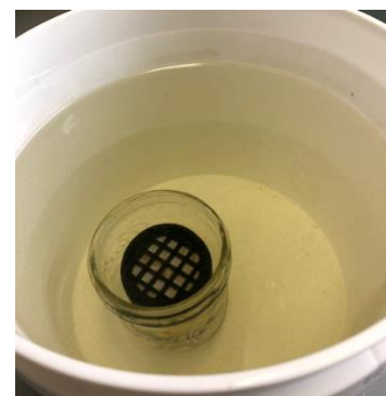
Figure 5: TADD in a bucket

The buckets were prepared 24hours before the trial. The TADD was 6" below the water's surface.