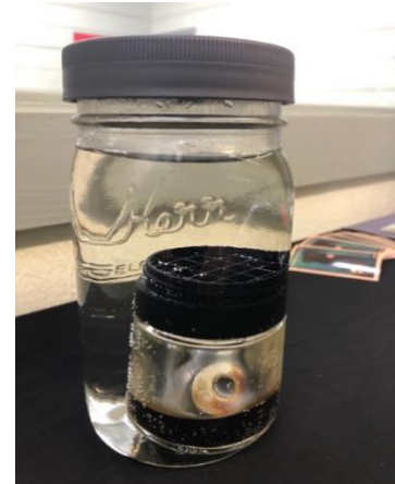
Figure 1: Mason jar containing TADD in water with oil and washer

2.3.3.4 Water – Standard drinking water was utilized, and all purchased from the same source.