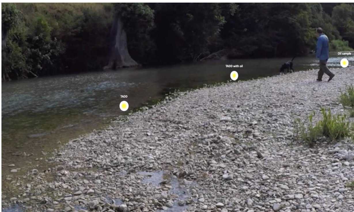
Figure 2: Baseline setup

The training aids were left to naturalize for 1-hour before being worked.