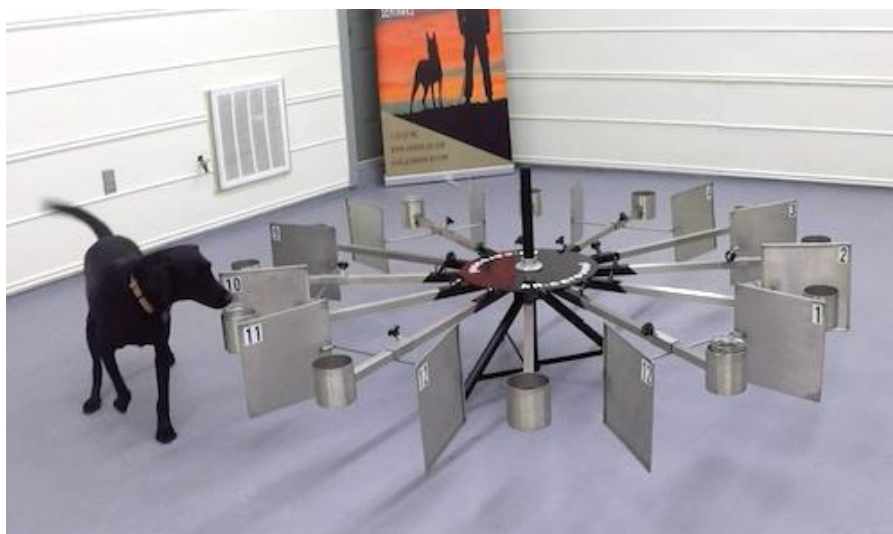
Figure 3: Carousel being searched by Chiron's Nika

Using clean water meant that no masking odor or bacteria in river water could influence the molecules. The climatic conditions within the lab would not facilitate the evaporation of the water from the mason jar.